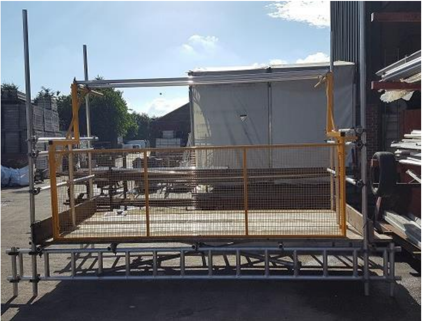
Fixed Gate – Drawing Number: SS0041 & SS0040