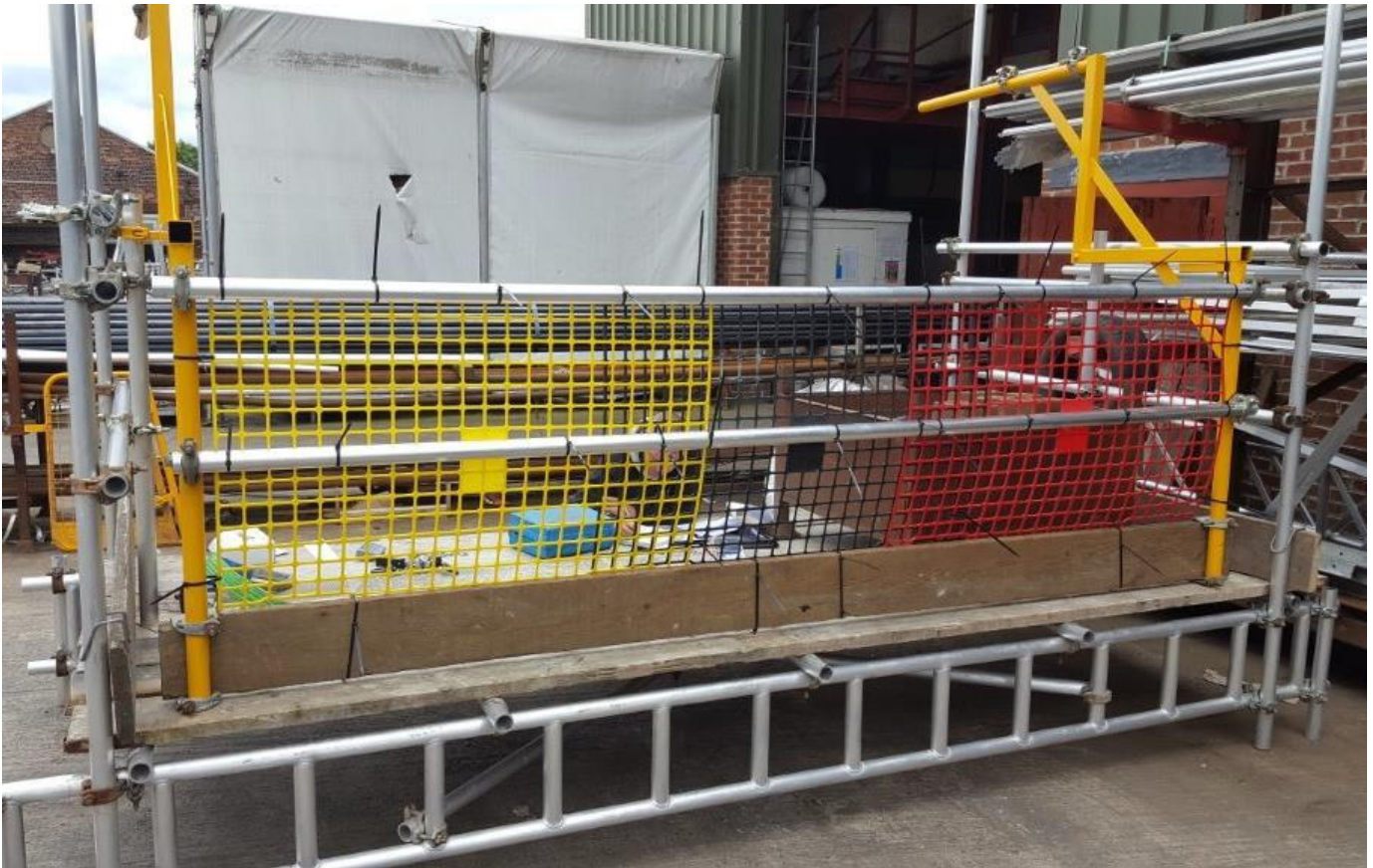
Tube & Fitting Gate – Drawing Number: SS0041 & SS0043